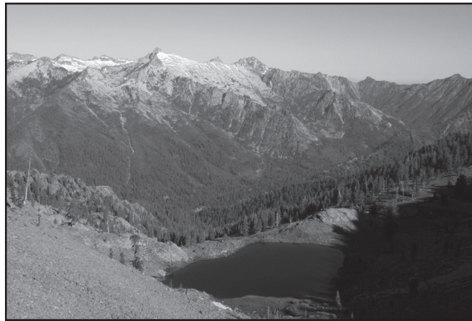
Trinity Alps Wilderness, CA

we were aware of issues such as fire suppression, grazing, and logging that had re-shaped many proposed wilderness lands. Fire suppression tactics had changed the structure and density of forests in a number of our original Wilderness areas. Historical grazing practices received certain accommodations by advocates for the Wilderness Act—they hoped to phase out the practice, but the presence of the ecological effects of grazing was not considered a barrier to designation. And early wilderness advocates recognized that some areas in the East, even though logged extensively in the past, had re-gained a wildness that, through “untrammelled” non-management going forward, could be protected through inclusion in the NWPS. Importantly, boosters of the Wilderness Act did not