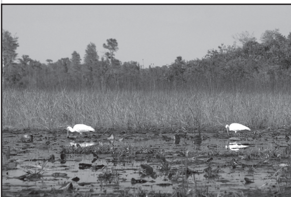
US Fish and Wildlife Service

Wilderness Watch is opposing a massive titanium and zirconium strip mine proposed by Twin Pines Minerals of Alabama for 12,000 acres on the eastern edge of the Okefenokee National Wildlife Refuge in southern Georgia.