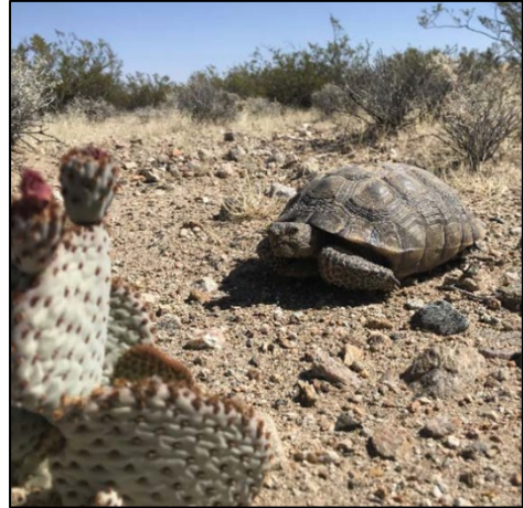
Desert Tortoise on a retired grazing allotment in Mojave National Preserve.

Congress has authorized the permanent closure of grazing allotments when the permits or leases are voluntarily waived. Successes include Death Valley National Park, Capitol Reef National Park, Arches National Park, Cascade-Siskiyou National Monument, Oregon Caves National Monument and Preserve, Owyhee Canyonlands, and Boulder-White Clouds Wilderness .