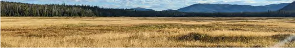
Elk Meadow, a retired grazing allotment in central Idaho.

A Winning Solution for Conflict Resolution