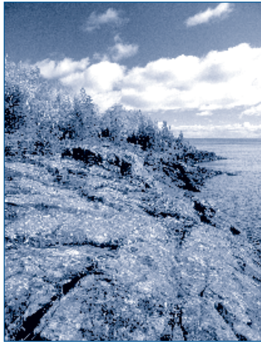
Isle Royale Wilderness, Michigan

Isle Royale National Park and Wilderness is actually an archipelago with one main island (45 miles long and nine miles wide) and a surrounding fleet of over 450 smaller islands. Native cultures have visited the island for 4,500 years and the Ojibwe called it "Minong," the good place. Much later, French visitors renamed the island to honor their king.